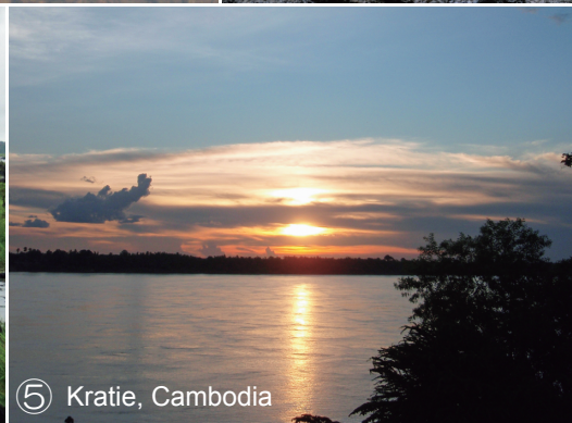
⑤ Kratie, Cambodia