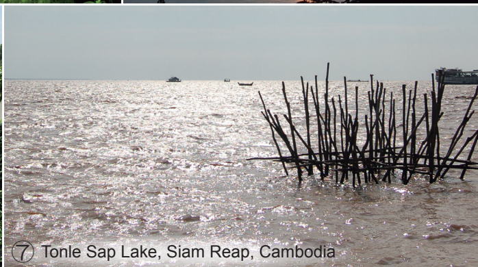
⑦ Tonle Sap Lake, Siam Reap, Cambodia