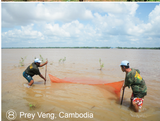
⑧ Prey Veng, Cambodia