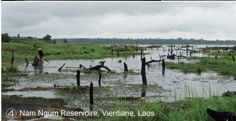
④ Nam Ngum Reservoir, Vientiane, Laos