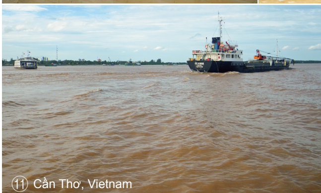
⑪ Cần Thơ, Vietnam