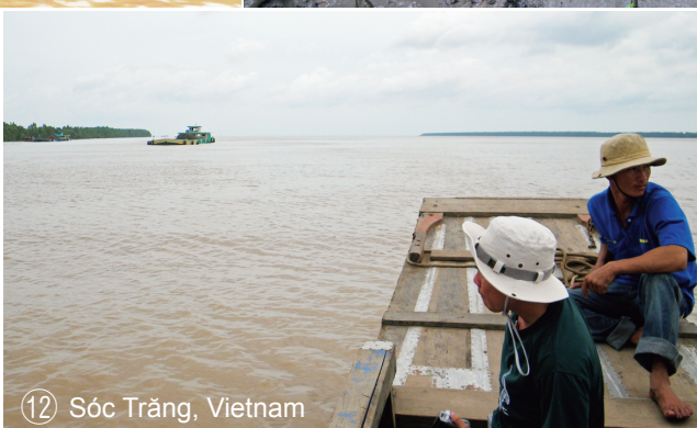
⑫ Sóc Trăng, Vietnam