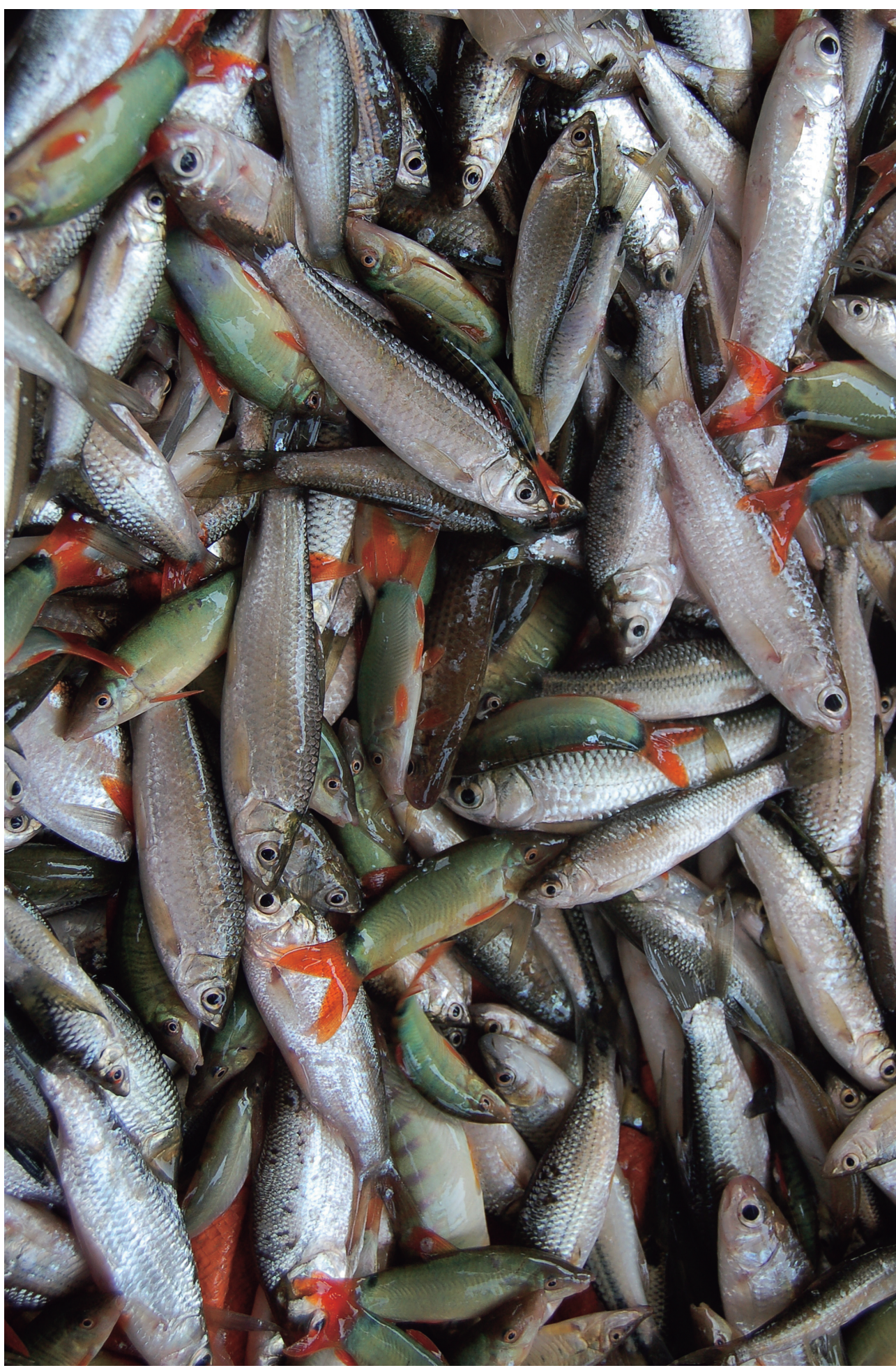
Fishes obtained by "Dai" fishery at Tonle Sap River, Cambodia