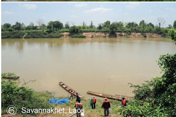
⑥ Savannakhet, Laos