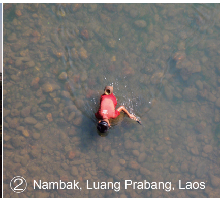
② Nambak, Luang Prabang, Laos