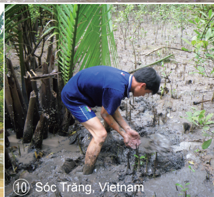
⑩ Sóc Trăng, Vietnam