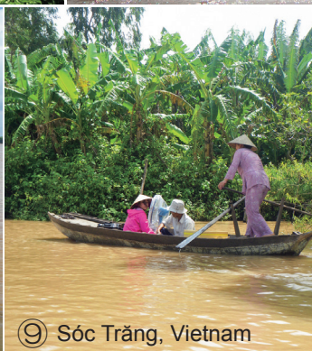
⑨ Sóc Trăng, Vietnam